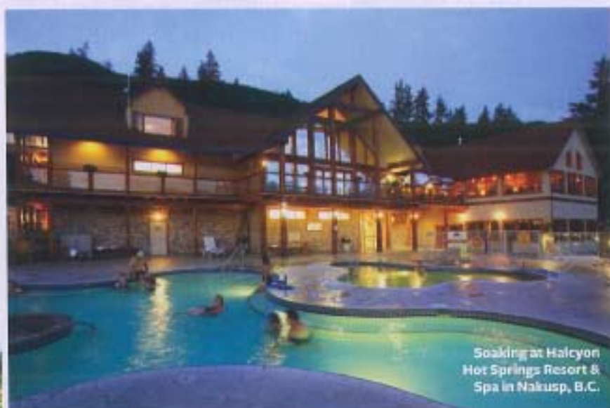
Soaking at Halcyon Hot Springs Resort & Spa in Nakusp, B.C.

Beach Life Phase 1 includes 50 metres of private beach, give or take a few metres depending on the water level of the lake.