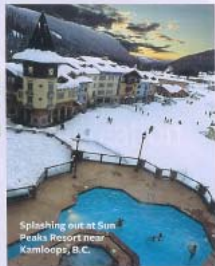
Splashing out at Sun Peaks Resort near Kamloops, B.C.