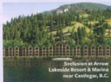
Seclusion at Arrow Lakeside Resort & Marina near Castlegar, B.C.

Available Approximately 30 percent of the 153 units, including 1- and 2-bedroom suites ($250,000 to $850,000) and several beachfront townhomes.