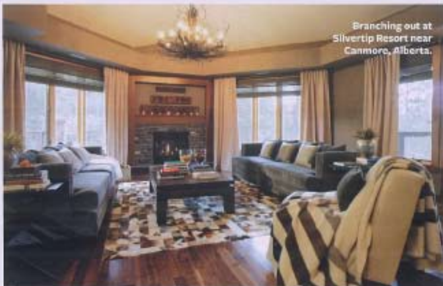
Branching out at Silvertip Resort near Canmore, Alberta.

the 20 homes should be built by January.