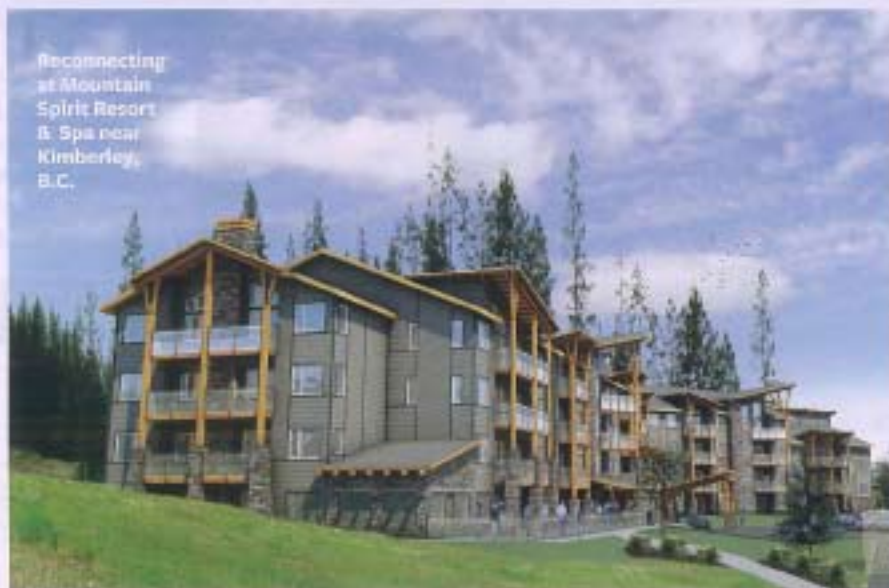
Reconnecting at Mountain Spirit Resort E Spa near Kimberley, B.C.

877-427-7330, mountainspiritresortandspa.com