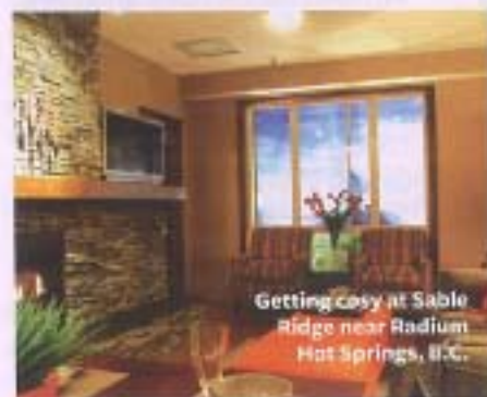
Getting cozy at Sable Ridge near Radium Hot Springs, B.C.

continuous wetland makes Radium an ideal spot for birdwatching. The annual Wings over the Rockies festival celebrates all things avian.