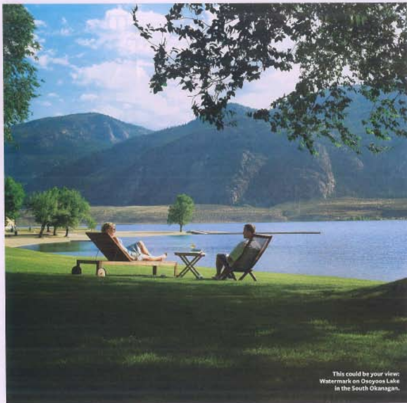
This could be your view: Watermark on Osoyoos Lake in the South Okanagan.