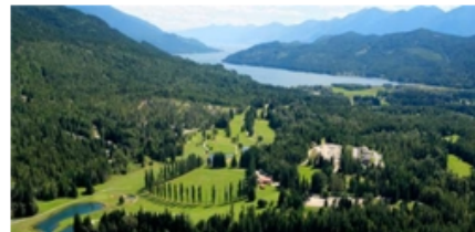
Kokanee Springs golf course