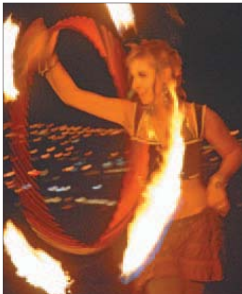
Nk'Mip Cellars and Spirit Ridge Vineyards Resort & Spa hosted their first annual Fire & Ice food and wine pairing event. Sipping icewine while a lithe belly dancer played with fire proved an entertaining culmination of the evening.