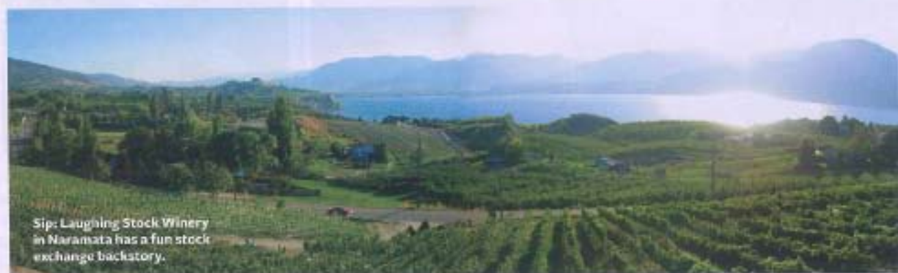
Sip: Laughing Stock Winery in Naramata has a fun stock exchange backstory.

The only Canadian spot to crack Frommer's Top Ten Destinations for 2007, the Okanagan Valley just gets hotter the further south you go—both temperature- and buzz-wise. Here's a rundown on what's new and notable.