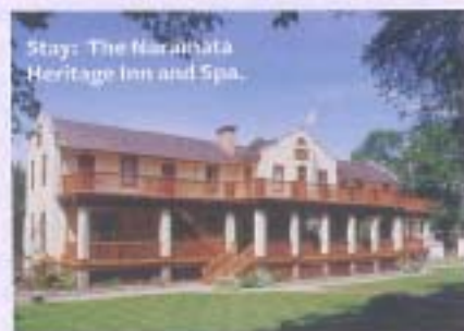
Stay: The Naramata Heritage Inn and Spa.

Sip Naramata is the once-sleepy summer village that has exploded with 20-some wineries. New-school winery names with amusing backstories (check out Laughing