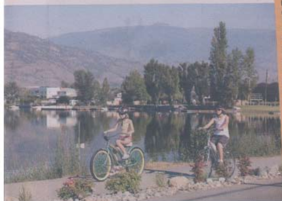
Bring your bikes and take a spin along the Lakeshore Drive paved shared-use trail.

some décor. And you'll find casual attire featuring 2010 Winter Olympic logos - being held in Whistler, B.C., at the Visitor Centre in Osoyoos.