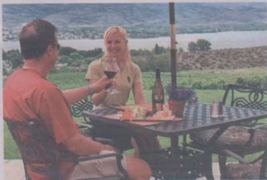
If you enjoy fine wines, "go for the gold" along the Golden Mile when you visit the Osoyoos area.

"Go a few miles in any direction and you'll find a golf course,"