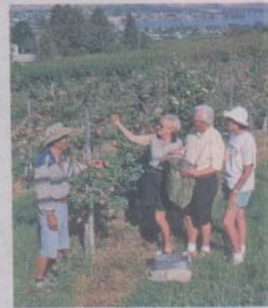
Fresh fruit and sunshine - Osoyoos has a plentiful supply of both.

Another downtown attraction is the unique Osoyoos Home Hardware store. Osoyoos Home Hardware includes a