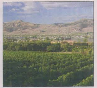
The NK'MIP Cellars vineyard with the town of Oliver and Lake Osoyoos in the background, viewed from the Spirit Ridge Vineyard Resort & Spa.

In winter the centre is open to visitors from 9:30 a.m. to 4:00 p.m. The desert trail system is open to self-guided tours in the winter, guided tours throughout