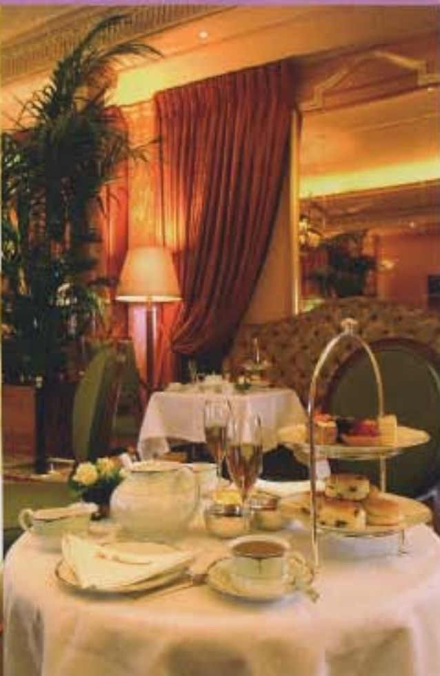
left: Along with Paris and New York, London offers probably the best shopping experience of any city in the world. www.dorchester.com | above: The Dorchester has grand dining, less formal eating, award-winning afternoon teas and a variety of distinctive private dining rooms. Reservations are recommended. Dorchester Hotel

department store Harrods, and countless boutiques. Included in the package are accommodation, a porter to carry your purchases, an appointment with a personal shopper and more.