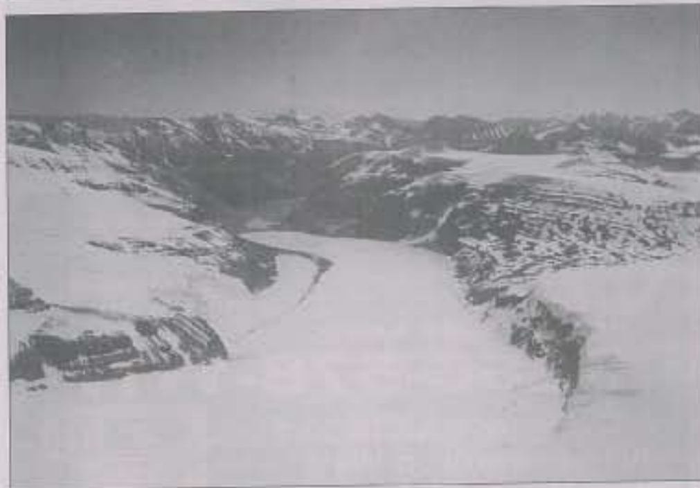
LESTER E. GIERACH/CONTINUED