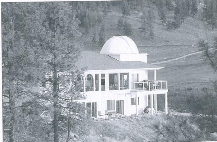
Stargazers from around the world come to the Observatory Bed and Breakfast in Osoyoos to watch the heavens with the aid of a 16-inch computer-controlled telescope that is housed under a dome on top of the house.